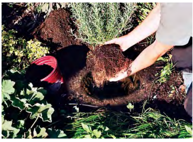
Dig a hole as deep as the root mass and twice as wide, and spread the roots out before planting.

Prepare the soil by mixing 20-25% compost into soil in planting beds. (For trees and shrubs, mix compost into the whole planting bed, or just plant in native soil and mulch well. Don't add compost just to their planting holes – that can limit root growth.) Then spread out the roots, add water, and tamp soil back in for good root contact. Set plants so the soil level is at the same height on the stem as at the nursery, to prevent problems. Mulch new plantings well, and be sure to water even drought tolerant plants during their first few summers, until they build deep roots.