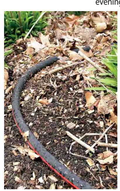
Soaker hoses save water! Cover them with mulch to save even more.