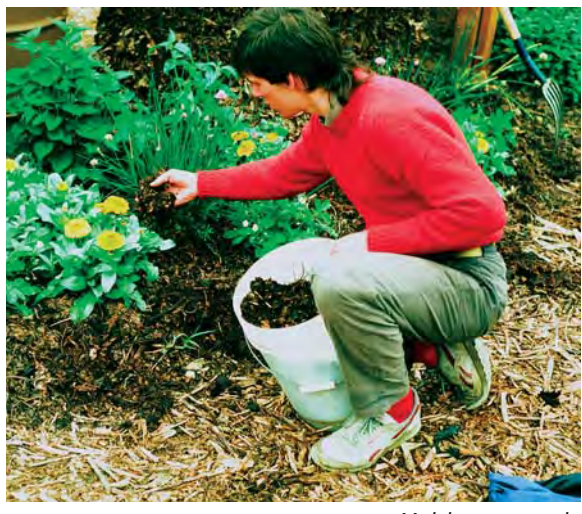
Mulch stops weeds, conserves water, and builds healthy soil for healthier plants. Spread mulch several inches deep and 1 inch away from plant stems.