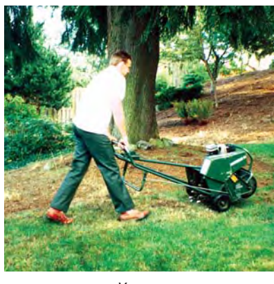
You can rent an aerator, or get a yard service to aerate for you.