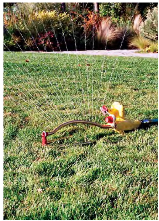
Water in early morning or evening to reduce evaporation.