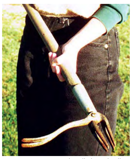
Long handled weed pullers pop dandelions out easily.